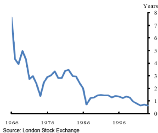
Figure 3. FTSE Average Holding Periods 1966-2005

1.5 However, the 7½ month figure does not offer a clear insight into the current state of play. Data from Tabb Group, UK National Statistics and the London Stock Exchange, shows that